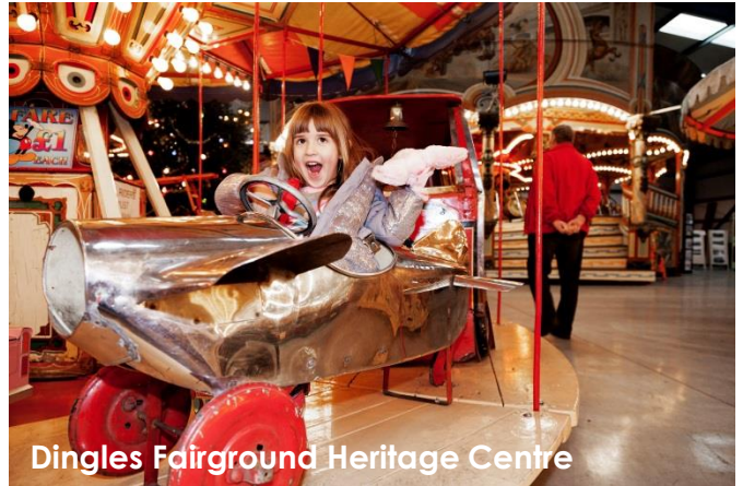
Dingles Fairground Heritage Centre

Visits contributed £4.6 million to local tourism economy